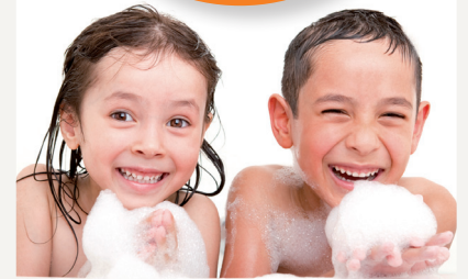
It's time for a better deal in hot water for Australian families